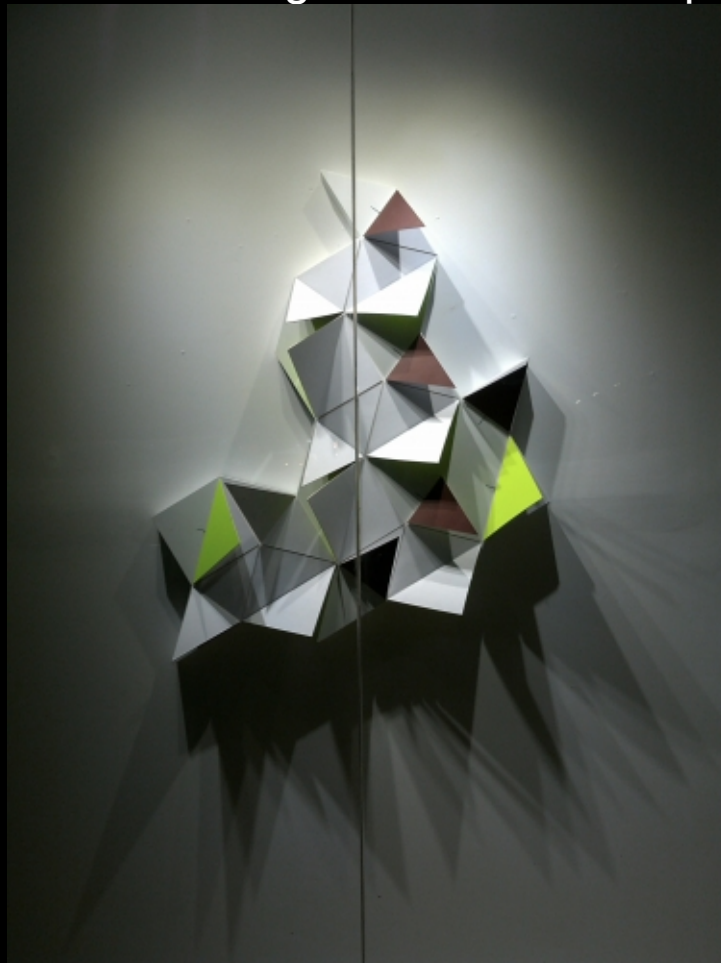
Lab[au], "Origam1," 2014.

mounted triangles, activated by memory alloy springs, slowly flips between white, red, green, and blue. While Lab[au] employs technology to control their work, Nonotak and François Wunschel rely on light, plexiglas, and geometry to endow two-dimensional objects with three-dimensional properties. Basic geometric images become complex as viewers activate Plexiglas and lenticular prints with their eyes.