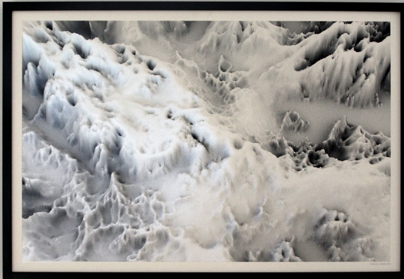
Joanie Lemerrier, "Landform_10," Video Project on Giclee Print, 2014.

These artists utilize technology to activate surfaces and alter or augment reality. The work of Joanie Lemerrier and Lab[au] directly employs digital technology to illuminate how simple concepts create dynamic pieces. Lemerrier's tessellated images are activated by light, which transforms the black and white tessellation into a morphing image – a topographic map becomes a crashing wave that changes into a cavernous canyon.